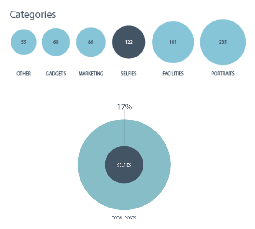
Figure 3. Types of images at Barcelona Games World.

Contrary to our perception during the participant observation, the overall proportion of selfies at Barcelona Games World was quite similar, even slightly higher (17%), than at Primavera Sound, and the number of portraits (32.7%) is undoubtedly higher. This finding is significant in terms of the role of the depiction of personal experience at this event and the interest in sharing it through social network sites. It seems that this event is closely related to the participants' identity (and, consequently, to their own personal narratives) and lived much more as an individual or small-group experience, in contrast to a music festival, where many of the pictures were of the stage and surroundings. At Barcelona Games World, the surroundings and facilities are present, as are gadgets and props, but depictions of people are far more prevalent (49.7% when combining selfies and portraits). Many of the selfies were taken with a selfie stick, so the perspective is more elevated, producing a specific type of image, with wider shots, people looking up the frame, and more of the background in the picture.