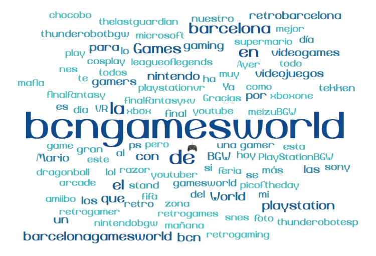
Figure 4. Tag cloud with the content in captions and comments from Barcelona Games World (frequency ranging from 716 to 10).

The tag cloud shown in Figure 4 reflects the content in picture captions and reveals further insights.