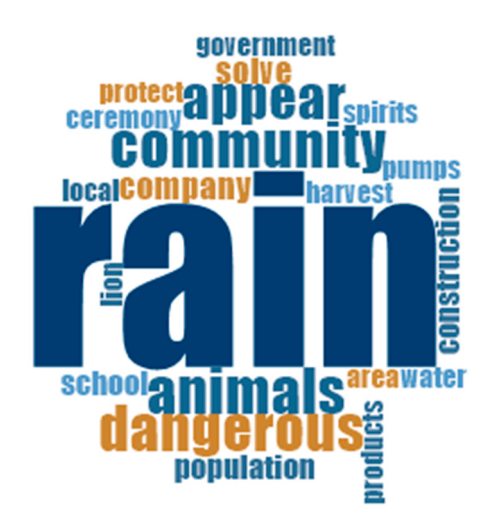
Figure 3. The most important ceremony.

In addition to traditional ceremonies, to respond to extreme climatic events such as drought and flood, the main adaptation strategies used by the communities of Nhanfisse and Muanandimae are shown in Table 4. As a way of responding to food shortages due to drought and flood, the interviewees showed that they would move to neighboring areas in search of better living conditions. Both respondents who showed mobility as well as those who prefer not to move temporarily identified the use of forest products to respond to times of scarcity.