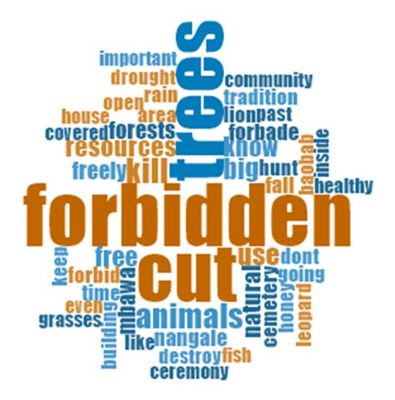
Figure 2. Use of natural resources in the past by the communities.

area and its conservation regulations) there were already customary restrictions and rules for the use of trees. "Do not cut trees" was the phrase most used by the interviewed residents in relation to the management of natural resources made in the past by the communities of Muanandimae (inside the GNP) and Nhanfisse (BZ of GNP) (Figure 2).