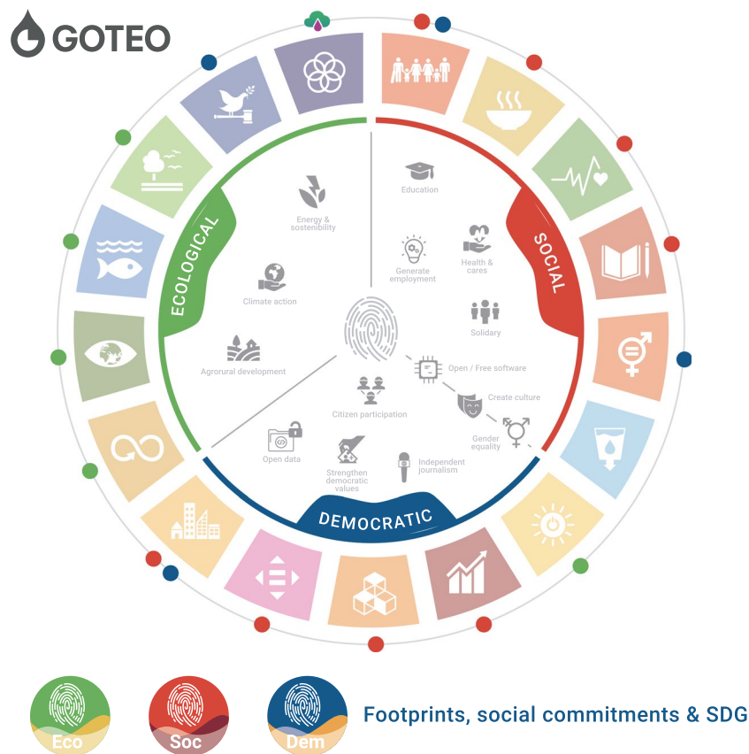
Fig. 1 Classification of the SDGs in Goteo according to social commitment classification and the ecological, social and democratic footprints.