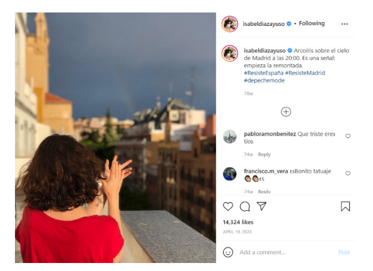
Figure 1. Díaz Ayuso clapping from a hotel room after testing positive for Covid-19 on April 19, 2020.

around. Clapping to the rhythm of Depeche Mode, she enjoys a beautiful sky with a rainbow and optimistically adds: "[The rainbow] is a sign. The recovery starts" (April 19, 2020).