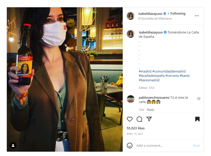
Figure 4. Díaz Ayuso holding a bottle with the flag of Spain and a picture of herself in the label on April 15, 2021.

We have seen how leaders' definition of the virus goes hand in hand with their responses to the crisis. In Madrid, Ayuso's shifting blame from the virus