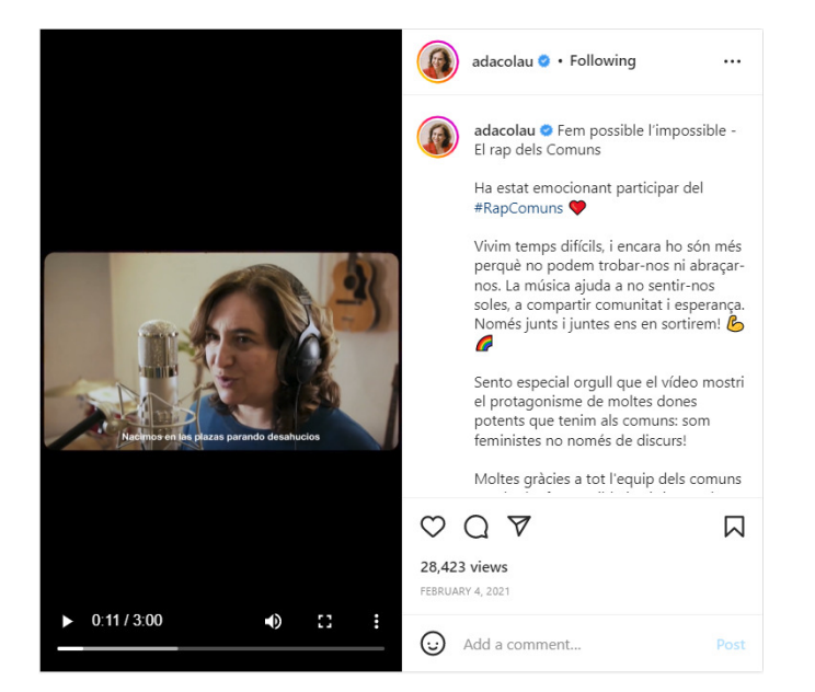
Figure 5. Colau singing "The Commons Rap" on February 4, 2021.

to governmental restrictions leads to an understanding of care in neoliberal terms. Taking care of the people appears as protecting their rights: their right to leisure and to consumption. While performing a populist opposition towards the status quo, she defies the left-wing coalition and expert advice but still sides with big corporations and economic interests. However, in Colau's Barcelona, caring for the people is understood as people's right to (community) life, to a sustainable planet, and to the public space. Her construction of a "free" people is traversed by a logic of radical care by which the leader helps citizens free themselves from economic interests.