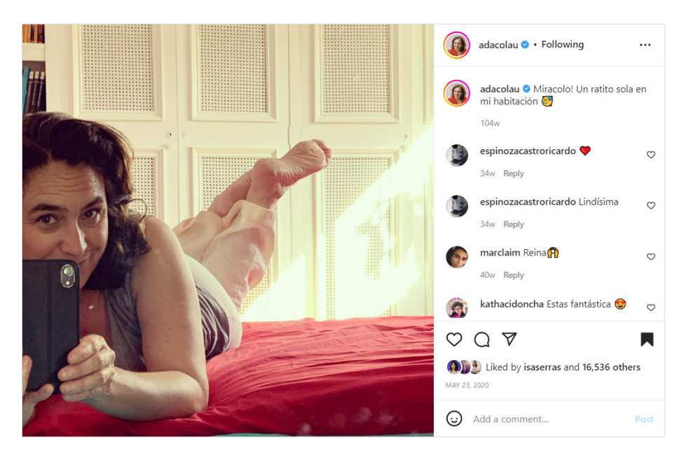
Figure 2. Colau lying in bed on May 23, 2020.

In stark difference, Ayuso performs herself as a celebrity, taking a central role through close-ups and posing surrounded by others, even going to schools to sign autographs. Visually, she is present, but care is absent. She is present on the streets, and in sites of care, posing often with medical workers. In fact, more than a third of the posts during the first wave features an Ayuso surrounded by health workers, visiting hospitals,