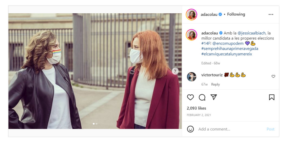
Figure 6. Colau wearing a mask with the LGBIT+ flag on February 2, 2021.

A quick look at their Instagram posts reveals that both leaders perform themselves as caring during the pandemic. However, a thorough analysis unveils very different performances of care. Following Sluga's (2014) conceptual differentiation between "caring for," "caring about," and "caring with," Ada Colau seems to lead the way in caring performances. Both Colau and Ayuso "care for" the people, something intrinsically related to their duty of attending to citizens' needs in times of crisis. The bigger difference appears in the other categories: "caring about" the people and personally worrying about their wellbeing, and "caring with" the people by jointly designing common caring projects. The content analysis reveals additional data. Colau performs caring "about" the people in over 80% of the posts, while she cares