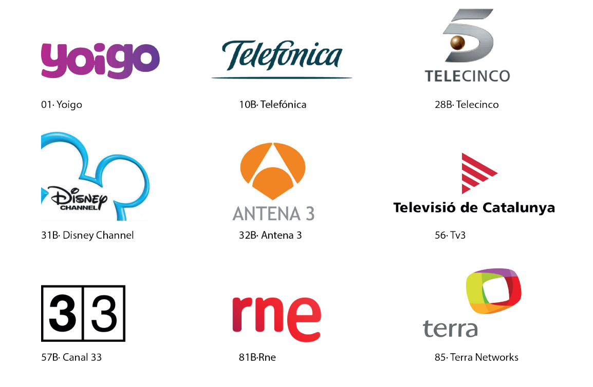
Figure 2 Part of the Sample.

The initial sign units are starting points of the analysis. By choosing one you define the point in the system of meanings where analysis begins. Depending on the focus of each section, a semantic, syntactic, rhetorical or pragmatic analysis of the sign may be carried out. For example, we can center on the level of expression of the sign and carry out a semantic analysis as a reductive process of semes that establish relations between units of meaning and also with visual-type perceptive units (Ruiz Collantes, 1998: 216) placing us in Block 2, Level 3.