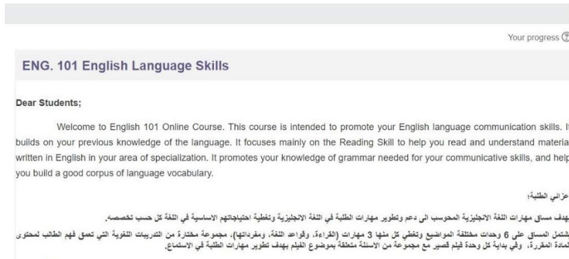
Figure 4. Welcome message in the VLE

Prior to the beginning of the course the language center provided compulsory online training for teachers in partnership with the quality assurance and accreditation center. The computer center also developed an online guide for teachers and students. This training together with the learners orientation workshops played a major role in the success of this experiment at Yarmouk University.