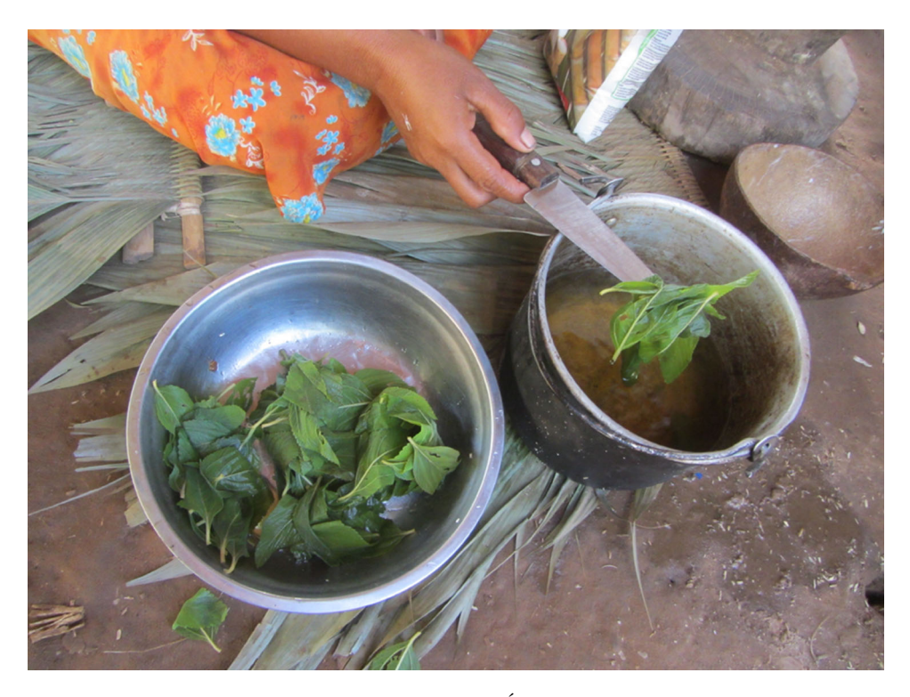
Fig. 3 Tsimane' woman preparing a medicine from medicinal plants

alternative to, or in combination with, biomedical options at a practical level.