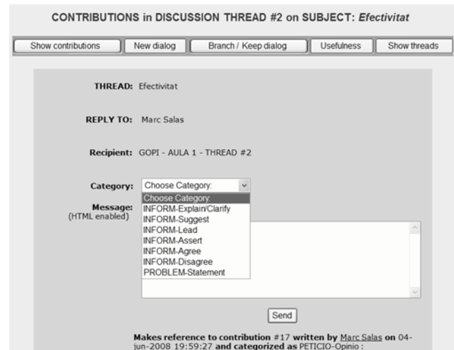
Figure 1. A list of tags to qualify a contribution

In order to avoid unnecessary choice, each context of the discussion process determines a precise and short list of just those categories that are possible in a certain point of the discussion process (e.g., in replying any kind of request, just the cards involving the provision of information are provided to classify the reply). This makes the choice of the appropriate tag shorter and easier (see Figure 1). In addition, the tutor is to examine and assess the quality of all contributions based partially on the tags used by students to categorize them. As a result, students are aware of the potential repercussions of