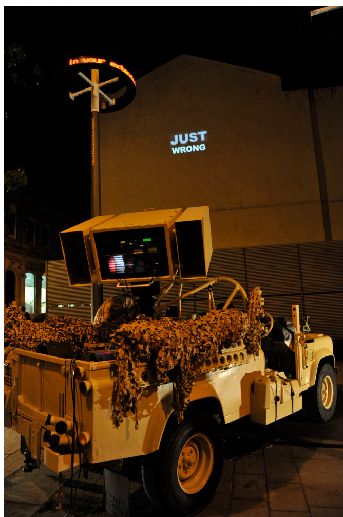
Image 2. War Veteran Vehicle Project

As the world's geo-political axis has shifted, so too has FACT. Indeed, if Liverpool has dubbed itself the centre of the creative universe, perhaps FACT has been one of the axes around which that creativity has revolved and evolved. The FACT Centre may originally have been conceived as a technocentric media arts centre, but it has blossomed through love, time and need into a true 21 st century arts centre; the embodiment of contemporary hybrid research and practice-based knowledge exchange, rich in participation, forging strong, deep – and essentially social – connections to a wide range of communities and places. The fascination here is the real-time negotiation of those relationships and nuanced interchanges which motivate communication, exchange and action. It is through comparing differences that we learn. The process and comparison of what is both out there and in here is the end in itself. The idea that art can be a container for meaning, or directly representational, is less and less interesting as methods of direct translation prevail. Direct experience and transmission suggest colourless technical and non-ideologised