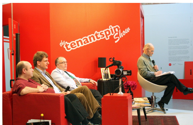
Image 1. The Tenantspin show

Conversely, with the shift from conventional perceptions of broadcast and narrowcast, time and space have been upended. Entire systems of belief and dogma have tumbled along with previous understanding and measurement of time: Time Collapse. We may no longer have the resources to upload everything. FACT, like many media art institutions, is under restrictions on income and it is very hard to prioritise conserving the past over investing in new ideas and people; therefore, the necessity to create automated instruments and data supply chains becomes critical. And with the burgeoning mass of collectable data this also creates a problem of how to forget...