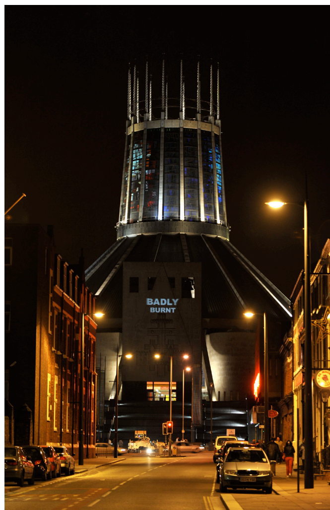
Image 3. War Veteran Vehicle projection on Liverpool Catholic Cathedral