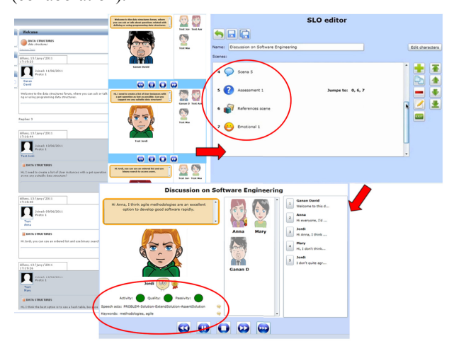
Figure 1. A live discussion supported with a web forum is converted in an animated CC-LO/SLO (left part); the SLO can be edited (upper part) to create a CC-LR playing complex learning scenes, such as cognitive assessment of the original participants and contributions (bottom part).

Collaborative Complex Learning Object (CC-LO) and their particularization, such as Storyboard Learning Object (SLO) were first presented and discussed in [35]. This new concept was justified by setting up two research questions about what makes a Learning Object (LO) [36] collaborative and what makes a LO complex, which cannot be easily answered by current standard learning objects. The key differentiators from the standard LO include multiple levels of abstraction from pedagogic context, learners, and representational medium (complexity), as well as intrinsic support for interaction across the object (collaboration).