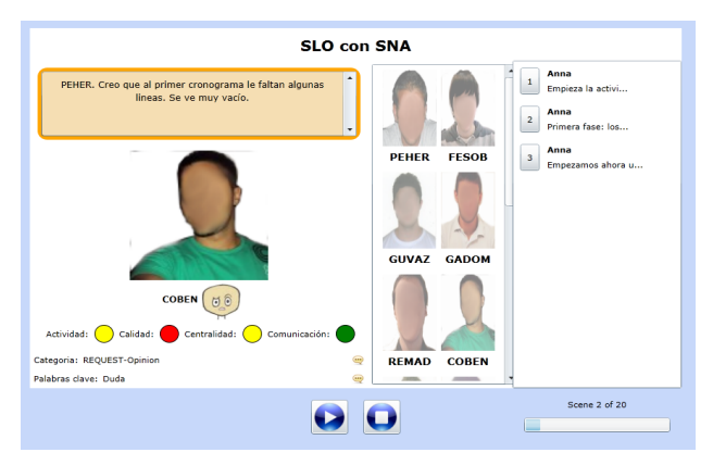
Figure 2. A CC-LR prototype showing cognitive and social network assessment (traffic light data). Actividad (Activity) and Calidad (Quality) indicators are produced by LA techniques while Centralidad (Centrality) and Comunicación (Communication) indicators are produced by SNA analysis.

The CC-LR contained cognitive and social assessment information, both deferred and immediate (see Section 2 for further information).