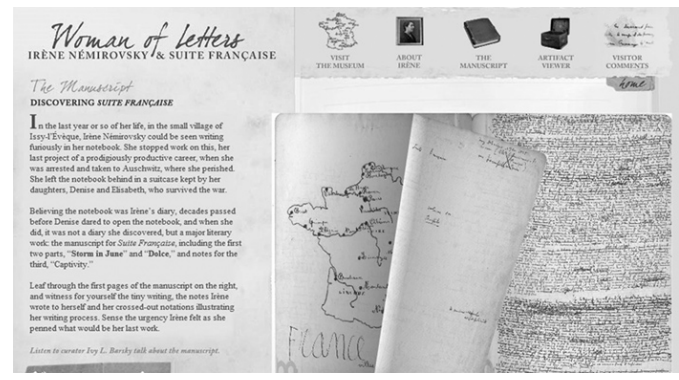
Figure 4. Online exhibit using interactive sketchbooks.

In both cases, the exhibitions use flash technology and allow visitors to explore some interactive sketchbooks left by the authors and digitised by the museum, where visitors can view notes and drawings by turning the pages and zooming to details with a simple click. Through the manipulation of these sketchbooks, users are allowed to browse the sketches of Ernst Ludwig Kirchners' renowned Street Scenes series, created between 1913 and 1915, and Georges Seurat's beautiful drawings balancing between light and shadow. Choreographic elements and the intuitive interface gracefully reveal the artwork and invite users to marvel and explore at will.