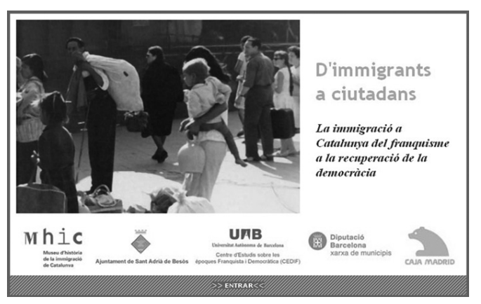
Figure 3. Online exhibit from the Catalan Immigration History Museum.

Similarly, in 2004 a collaborative work with the Catalan Immigration History Museum<sup>18</sup>, a small institution with limited funding that wished to promote its temporary exhibitions was done and a series of HTML templates were created for easily downloading images and texts from the real exhibitions in order to generate an online resource.