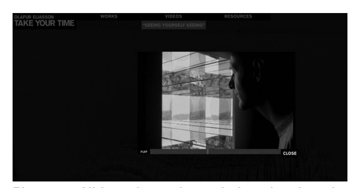
Figure 5. Video about the website showing the installation 'seeing yourself see' undertaken by Olafur Eliasson.

Likewise, the exhibition 'Take Your Time'30 of the contemporary artist Olafur Eliasson, staged in 2008 at MOMA, lifted a long internal debate about the legitimacy of removing content considered not relevant to the theme of the exhibition. In this case the event's goal was testing new ways to encourage participation. The initiative, conducted by the Scandinavian artist, intended to encourage visitors to describe and comment his work without the museum's interference<sup>31</sup> through an environment designed by 'SFMOMA new media group' where they could give expansion to their views. The interactive kiosk/website offered background commentaries and information about the artist's philosophy but left to the visitors the description of the individual works in detail of which each of them have a personal experience of the show. The traditional presentation of the exhibition in internet was therefore replaced by a customised WordPress blog.