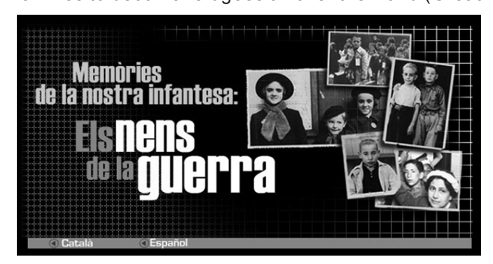
Figure 2. Home page of 'Memories of our childhood: The war children' 15.

In 2003, the authors were also involved in such a kind of hearts-on exhibition, which became quite rewarding in personal terms (The same year we produced an on-line exhibition called 'Images of stone: the Tunisian mosaics'14 which displayed a selection of quality Roman mosaics discovered in this country. The online exhibit attempted to explain complementary information about mosaic techniques. iconography, mosaic schools and same examples of different parts of the Roman Empire. It included a 3D reconstruction with Shockwave 3D of the Roman villa of Els Munts (Tarragona, Spain). It was an online version of a temporary itinerant exhibition about the Spanish Civil War (1936-1939) 'Memories of our childhood: The war children'15, still a taboo subject in contemporary Spain. However, the virtual version changed completely its structure, since it was believed that the most attractive part were the testimonies of those former children that were now old people. It was decided to see the whole war conflict through the eyes of children who left their families to become refugees all over the world (Great