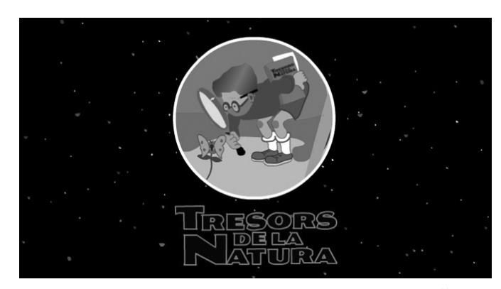
Figure 1. Home page of 'Treasures of Nature'11.

was an object-oriented exhibition complemented with more multimedia documentation in its virtual version as well background or personalised information for the diverse audiences that could access it. One of the main differences of this exhibit was its dissemination, since it was focused on educators and schools apart from the general public. One of the main surprises was that the virtual resource was employed in formal educational contexts, therefore giving a second life to the display.