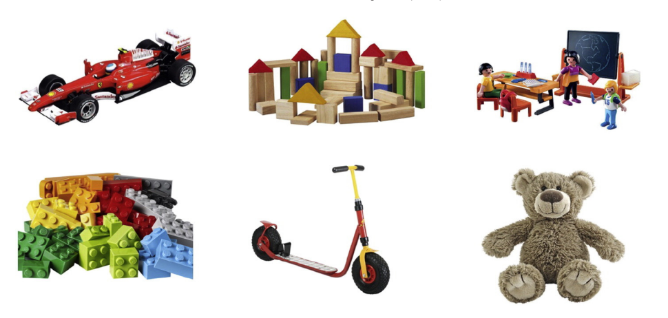
Fig. 2. Pictures of the nonfood products displayed on the memory cards.

children finished the experiment they could select 1 sticker as a reward for participation. After children started to play the memory-game, children could eat ad libitum from the four bowls of fruit. After each session, the experimenter weighed the bowls to calculate caloric intake. The experimenter refilled and weighed the bowls before the next child entered the room to make sure that the children did not notice how much the previous child had eaten.