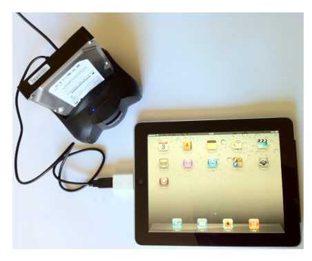
Fig. 2. iPad connection to external hard drive via Camera Connection Kit.

After connecting the USB external drive to the iPad (see Figure 2), we can check its presence within the SSH session by looking for the /dev/disk1 device. The iPad internal storage disk is assigned the device name /dev/disk0, so the presence of such device implies that the newly connected hard drive has been correctly recognized.