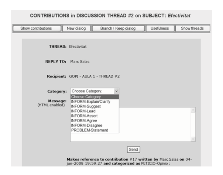
Figure 1. A list of tags to qualify a contribution

In order to avoid unnecessary choice, each context of the discussion process determines a precise and short list of just those categories that are possible in a certain point of the discussion process (e.g., in replying any kind of request, just the cards involving the provision of information are provided to classify the reply). This makes the choice of the appropriate tag shorter and easier (see Figure 1). In addition, the tutor is to examine and assess the quality of all contributions based partially on the tags used by students to categorize them. As a result, students are aware of the potential repercussions of