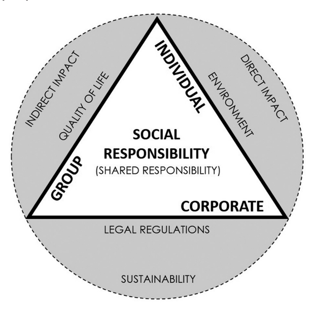
Figure 2 . Collective Social Responsibility model (CSRm), the theoretical proposal