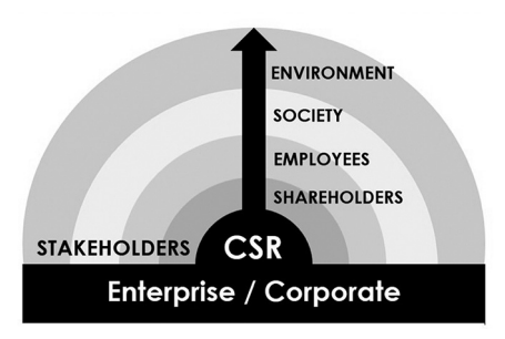
Figure 1 . Source and scope of Corporate Social Responsibility. Traditional vision

Nevertheless, as already mentioned, the elements exposed here orbit mainly on a common axis and are company orientated, passing through the stakeholders, shareholders, employees, and society until reaching the environment. See Figure 1.