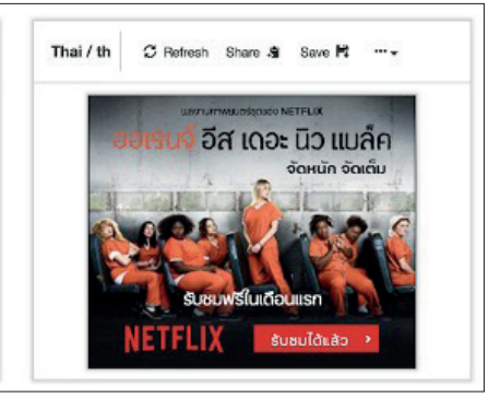
Image 1. Adaptation of Netflix Original artwork to different territories.