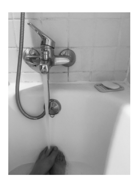
Figure 1. Photo 0: BATH. Wednesday 02.27.19 / 00:20