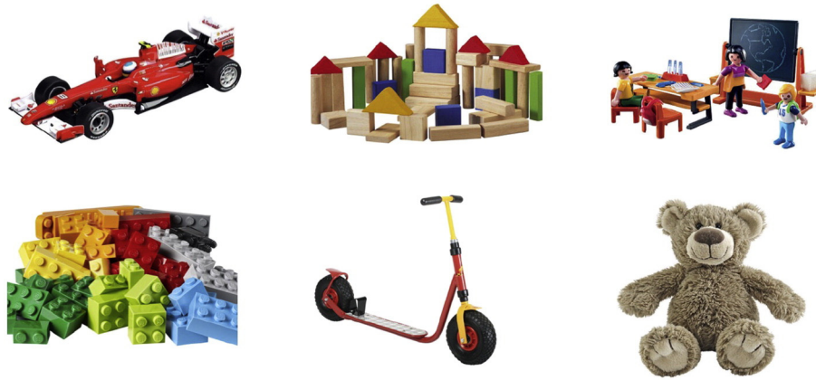
Fig. 2. Pictures of the nonfood products displayed on the memory cards.

children finished the experiment they could select 1 sticker as a reward for participation. After children started to play the memory-game, children could eat ad libitum from the four bowls of fruit. After each session, the experimenter weighed the bowls to calculate caloric intake. The experimenter refilled and weighed the bowls before the next child entered the room to make sure that the children did not notice how much the previous child had eaten.